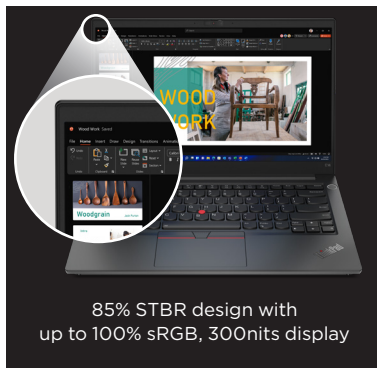
85% STBR design with up to 100% sRGB, 300nits display