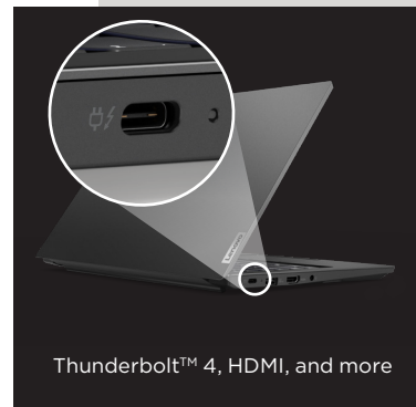
Thunderbolt™ 4, HDMI, and more