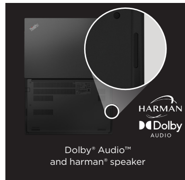
Dolby® Audio™ and harman® speaker