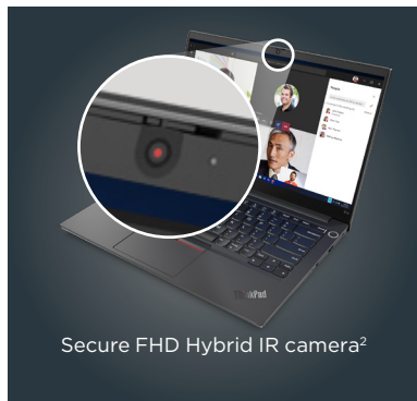
Secure FHD Hybrid IR camera 2

A complete set of ports—including full-function USB-C, HDMI, USB-A, and always-on USB —make connecting to peripherals hassle-free. Wi-Fi 6E 2 offers superfast connectivity, uploads and downloads even in congested networks.