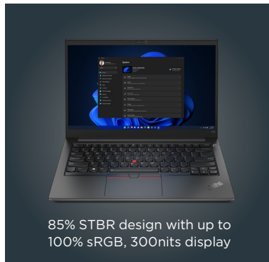
85% STBR design with up to 100% sRGB, 300nits display