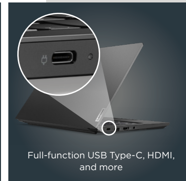
Full-function USB Type-C, HDMI, and more