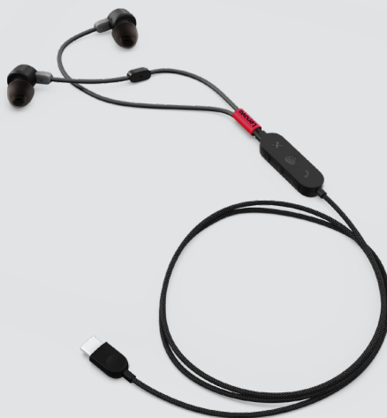
LENOVO GO USB-C ANC IN-EAR HEADPHONES PN: 4XD1C99220

This sleek and stylish full-size mouse design offers exceptional quality in a modern wireless solution. The compact ambidextrous mouse provides excellent portability and perfect ergonomics. Complete tasks with ease using the precise 1200 DPI optical sensor. Connect compatible Lenovo devices with just one nano receiver.