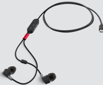
Lenovo Go USB-C ANC In-ear Headphones PN: 4XD1C99220

Designed to complement the lifestyle of ultrabook users, the Lenovo Go USB-C Wireless Mouse is crafted for superior portability and comfort. With a blue optical sensor that works on most surfaces and USB-C connectivity, it is ready to thrive in a dynamic workplace. Its ultra-long battery life and programmable utility button ensure it is capable of any task and ready to be used at a moment's notice.