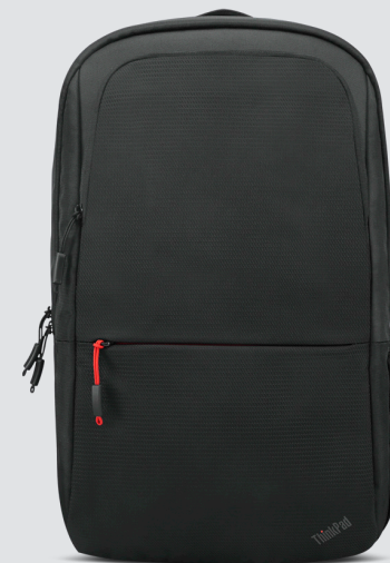
THINKPAD ESSENTIAL 16-INCH BACKPACK (ECO) PN: 4X41C12468

Designed for modern professionals, the Lenovo USB-C Universal Business Dock has everything that helps boost your productivity to the next level. With enhanced port expansion, optimum power delivery, and dual display support in a small space-saving, stylish exterior, the dock is the perfect companion for hybrid workspaces.