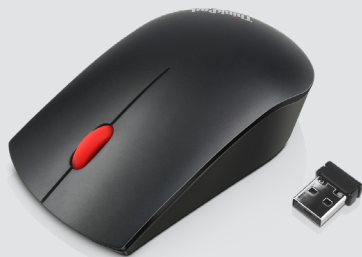
THINKPAD ESSENTIAL WIRELESS MOUSE PN: 4X30M56887

This sleek and stylish full-size mouse design offers exceptional quality in a modern wireless solution. The compact ambidextrous mouse provides excellent portability and perfect ergonomics. Complete tasks with ease using the precise 1200 DPI optical sensor. Connect compatible Lenovo devices with just one nano receiver.