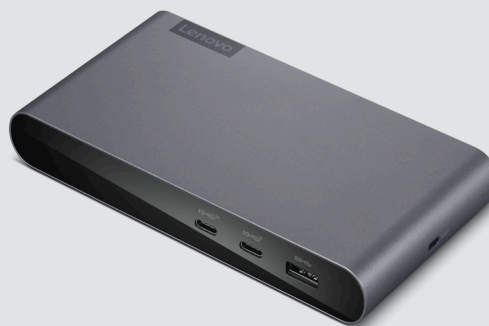
LENOVO USB-C UNIVERSAL BUSINESS DOCK PN: 40B30090XX

This sleek and stylish full-size mouse design offers exceptional quality in a modern wireless solution. The compact ambidextrous mouse provides excellent portability and perfect ergonomics. Complete tasks with ease using the precise 1200 DPI optical sensor. Connect compatible Lenovo devices with just one nano receiver.