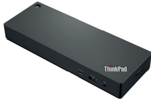
ThinkPad® Universal Thunderbolt™ 4 Dock PN: 40B00135xx