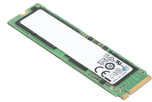
ThinkPad 1TB PCIe NVMe OPAL2 M.2 2280 SSD PN: 4XB0W79582