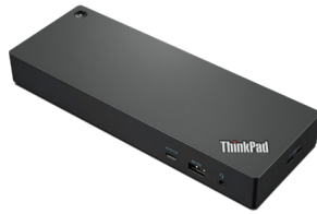
ThinkPad Universal Thunderbolt™ 4 Dock