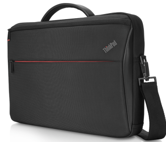
ThinkPad 14-inch Professional Slim Topload