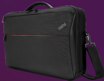
ThinkPad 14-inch Professional Slim Topload