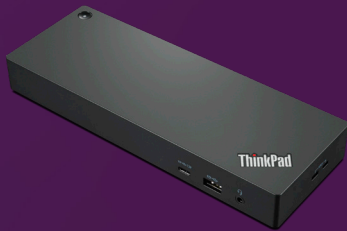
ThinkPad Workstation Thunderbolt™ 4 Dock