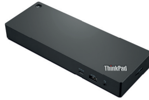
ThinkPad Universal Thunderbolt 4 Dock PN: 40B00135xx