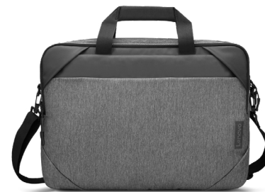
Lenovo Business Casual 15.6-inch Topload