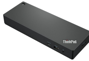
ThinkPad Universal Thunderbolt 4 Dock