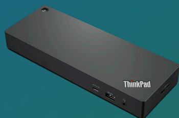
ThinkPad Workstation Thunderbolt™ 4 Dock