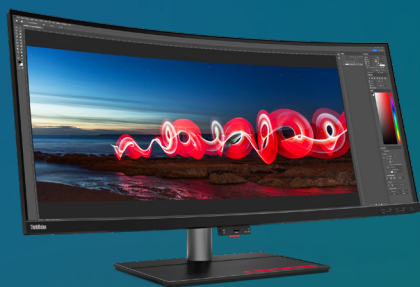
ThinkVision P40w Display