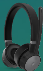
Lenovo Go Wireless ANC Headset