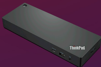
ThinkPad Workstation Thunderbolt™ 4 Dock