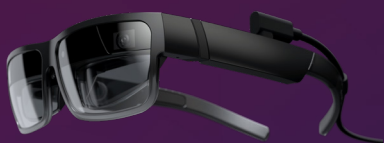
ThinkReality A3 XR1 3G+32G

For a full list of accessories and options, please visit: accsmartfind.lenovo.com