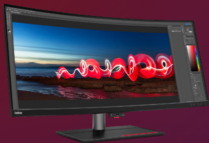
ThinkVision P40w Display