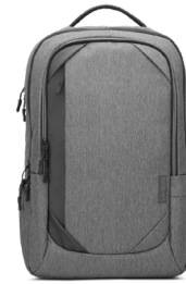
Lenovo Business Casual 17-inch Backpack