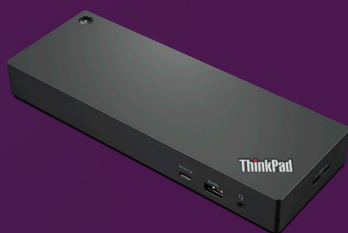
ThinkPad Workstation Thunderbolt™ 4 Dock