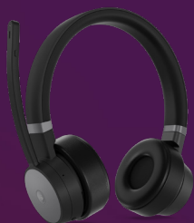
Lenovo Go Wireless ANC Headset