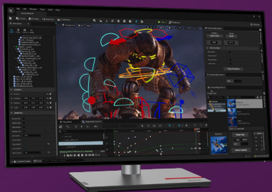
ThinkVision P27h-30 Display