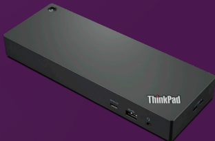
ThinkPad Workstation Thunderbolt™ 4 Dock PN: 40B00300xx