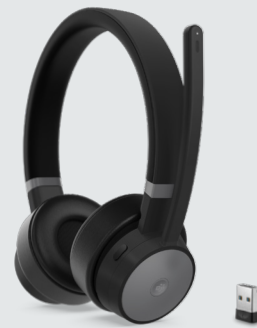
Lenovo Go Wireless ANC Headset PN: 4XD1C99222, 4XD1C99221 (w/o stand)

Designed for modern professionals, the Lenovo USB-C Universal Business Dock has everything that helps boost your productivity to the next level. With enhanced port expansion, optimum power delivery, and dual display support in a small space-saving, stylish exterior, the dock is the perfect companion for hybrid workspaces. With 11+ helpful expansion ports, optimizing your workspace and workflow has never been easier. It offers lightning-quick data transfers, dual 4K monitors, and rapid charging for notebooks up to 65W with the included adapter or up to 100W with the optional 135W adapter. It also supports one-click firmware updates even without Dock Manager.