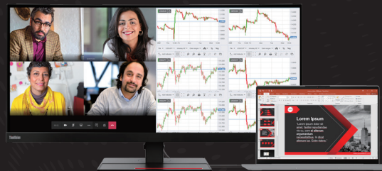
Master the art of multi-tasking

The P34w-20 kicks your work up a notch with outstanding visuals to show accurate colors from any angle. With WQHD 3440 x 1440 resolution, the monitor helps you capture even the smallest details while seeing true-to-life color with a 99% sRGB color calibration Delta E<2. Designed to impress, the 2 x 3W built-in speakers offer immersive audio that is true to your ears. The P34w-20 is also created with your health and comfort in mind, with eye-care and Natural Low Blue Light technology to reduce harmful high energy blue light emissions. Adjust the monitor height up to 150 mm to suit your ideal working style or position. Meanwhile, Lenovo ThinkColour 2 software allows you to easily and quickly adjust your screen settings with a simple click to enhance your work efficiency and optimize your monitor's extensive capabilities. Lenovo patented features, such as LAN on ThinkColour, show the network status from the screen to facilitate a more seamless workflow.