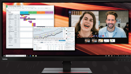
An eye – and ear – for detail

The P34w-20 kicks your work up a notch with outstanding visuals to show accurate colors from any angle. With WQHD 3440 x 1440 resolution, the monitor helps you capture even the smallest details while seeing true-to-life color with a 99% sRGB color calibration Delta E<2. Designed to impress, the 2 x 3W built-in speakers offer immersive audio that is true to your ears. The P34w-20 is also created with your health and comfort in mind, with eye-care and Natural Low Blue Light technology to reduce harmful high energy blue light emissions. Adjust the monitor height up to 150 mm to suit your ideal working style or position. Meanwhile, Lenovo ThinkColour 2 software allows you to easily and quickly adjust your screen settings with a simple click to enhance your work efficiency and optimize your monitor's extensive capabilities. Lenovo patented features, such as LAN on ThinkColour, show the network status from the screen to facilitate a more seamless workflow.