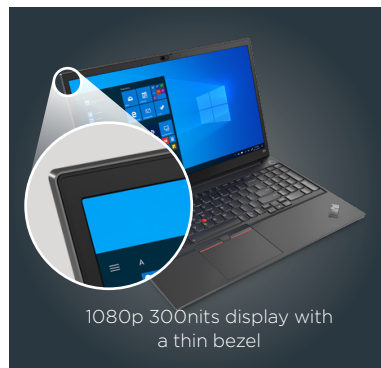
1080p 300nits display with a thin bezel