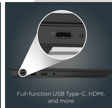
Full-function USB Type-C, HDMI, and more