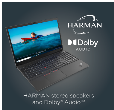
HARMAN stereo speakers and Dolby® Audio™

The data and device are safeguarded with multiple security features on the E15 Gen 3. Log in instantly with facial recognition using the IR camera, 2 or with the FPR integrated 2 on the power button. Maintain webcam privacy by simply sliding the ThinkShutter camera cover when not in use.