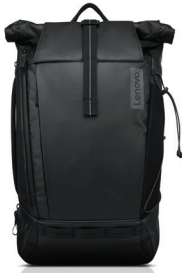
Lenovo 15.6" Commuter Backpack