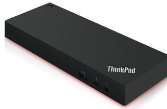
ThinkPad® Thunderbolt™ 3 Workstation Dock Gen 2