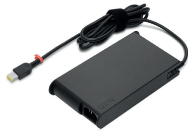
Slim ThinkPad 230W AC Adapter